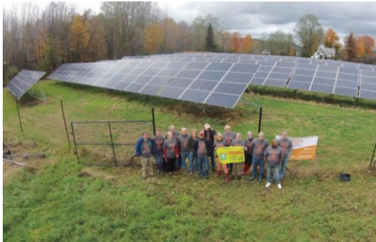
Boardman Hill, a Vermont Community-Owned Solar Array in West Rutland

The year 2014 saw the installation of a 148 KW solar array in Cavendish to supply municipal buildings with solar generated electricity. Installation was complete at the beginning of 2015 and the town is now seeing substantial reductions in electric costs.