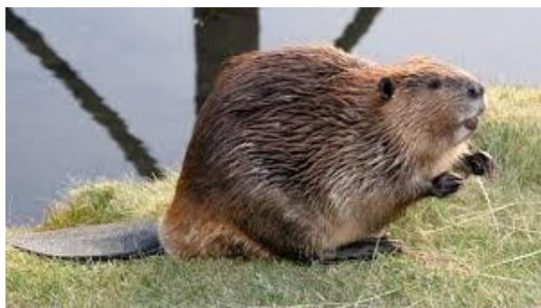
A second event planned for May will focus on the Beavers in our backyards.